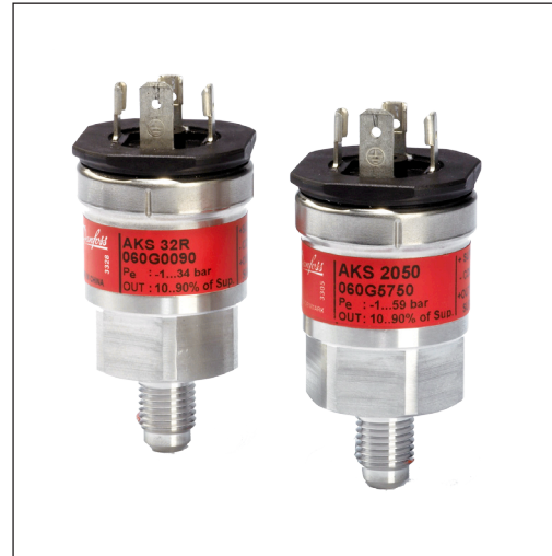
AKS 2050 is for high pressure and with pulse-snubber in the pressure connection