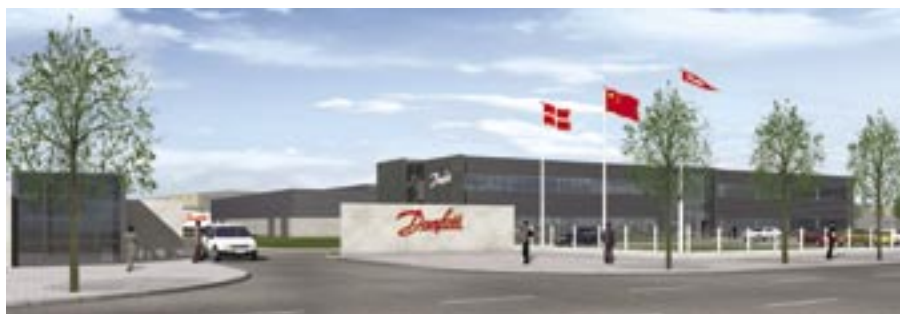
The majority of our line components are produced in our new factory in China.

Danfoss thus fulfils international standards with respect to product development, design, production, sale and environmental awareness.